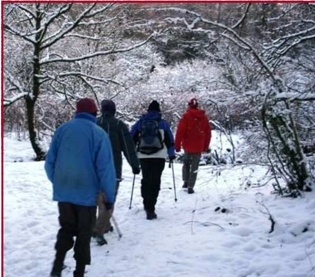
A CTC 'ride' in December 2010.